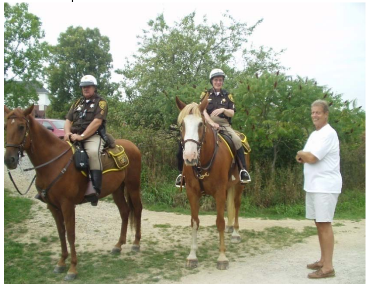
A Trail user stops to talk to Mounted Patrol deputies near Tienken Road September 2007

From 1990-2002, Oakland County Sheriff's Mounted Division provided voluntary horseback patrol of the Trail from May through October of each year to help enforce the Uniform Trailways Ordinances. Since 2004, the Trailways Commission, through financial contributions from our voting member communities, has contracted with the Sheriff's office for Mounted Patrol Services. In 1998, the Trailways Commission explored and created the use of a part-time bicycle patrol, in part, as an effective means of enforcing the uniform ordinances. The bike patrol program runs from May 1 until October 31 each year. The Bike patroller is responsible for reminding Trail users of the Uniform Trailways Ordinances, as well as maintenance inspections, public relations, and offering limited mechanical assistance to bicycle users.